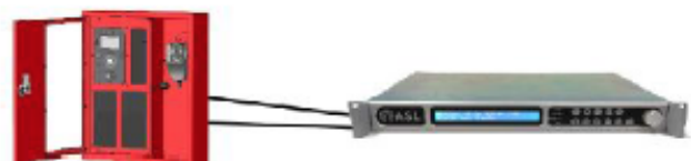
Dual Redundant Connection to a Single Router

If the EMS is used with a single audio router, then both the Router 1 and Router 2 Microphone Ports can be used, in order to provide dual redundant cabling between the EMS microphone and the router. In this installation the microphone will continue to operate normally even if one of the two connection cables is cut.