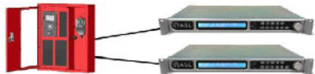
Connection to Dual Redundant Routers

If the EMS is used with a PA/VA system which has dual redundant 'A' and 'B' audio routers, then both the Router 1 and Router 2 Microphone Ports are used, one connected to each ASL Audio Router. In this installation the PA/VA system will continue to operate even if one of the audio routers suffers a total failure, such as a loss of power to that equipment room.