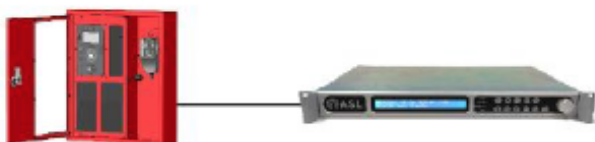
Single Router Connection

The most basic connection method uses either the Router 1 or Router 2 Microphone Port connected direct to a single ASL audio router.